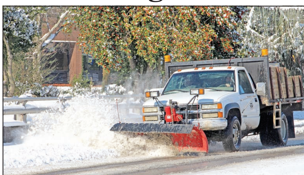
The Union County Road Department worked around the clock with nearly a dozen trucks to make sure roads were scraped and treated for safer travel.

Sunday was much the same as Saturday, with See Weather, Page 2A