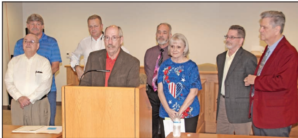
Several pastors from the area attended the April county commission meeting, to offer a preview of the upcoming National Day of Prayer on Thursday, May 4.

Area preachers will take See Prayer, Page 2A