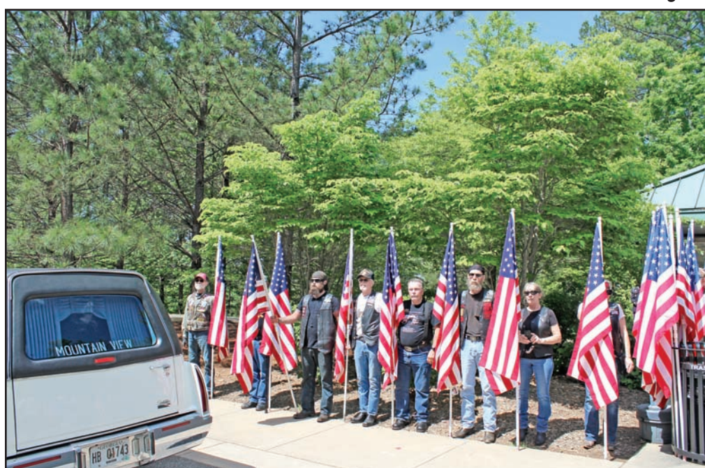
Veterans greet the five who were laid to rest at the Georgia National Cemetery in Canton on Wednesday, April 26.