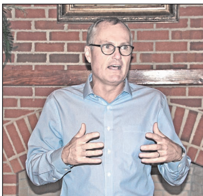
Georgia Lt. Gov. Casey Cagle at the Brackett Community Room on Tuesday, Aug. 15.

"There are three important ingredients that we've got to be focused on moving forward," said Cagle, "who is running for governor. "First and foremost is, in order to continue to be a pro-business