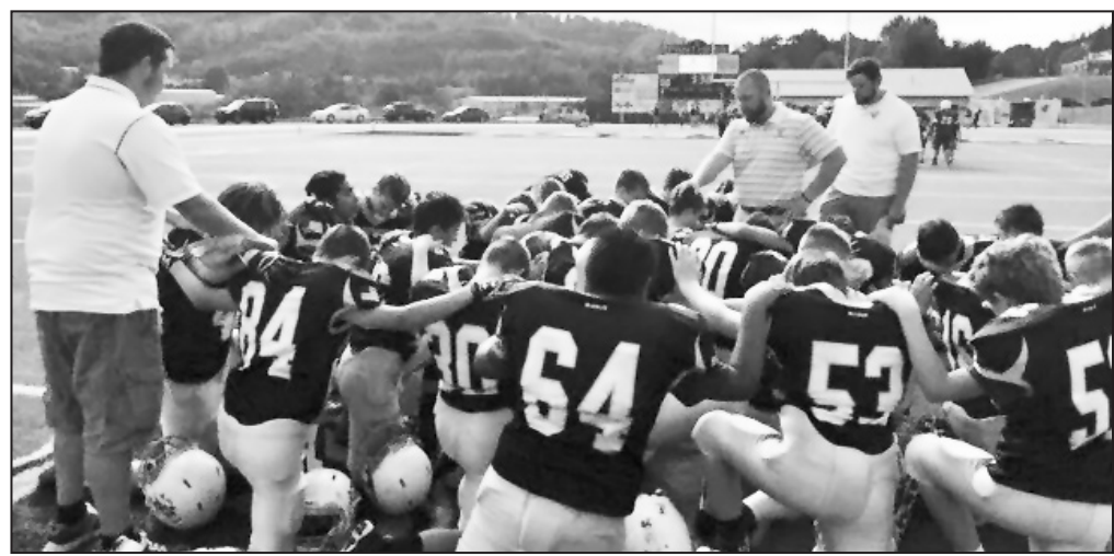
Union County youth football