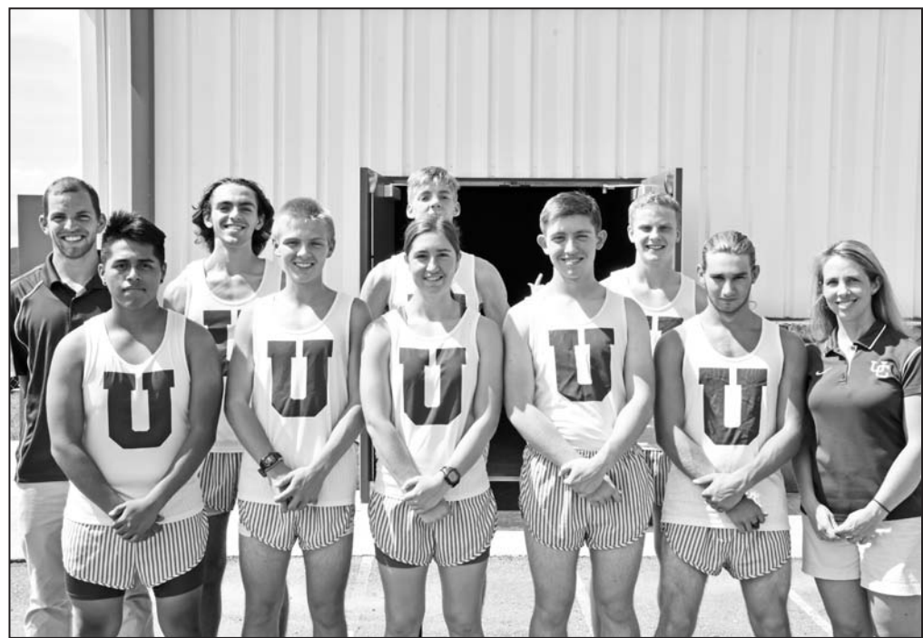
The Union County seniors are less than a month away from their final region meet.