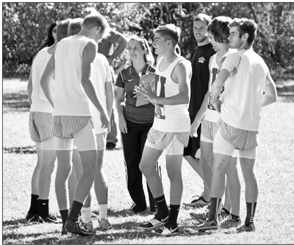
The Union County Cross Country teams and coaches prior to last week's region meet.