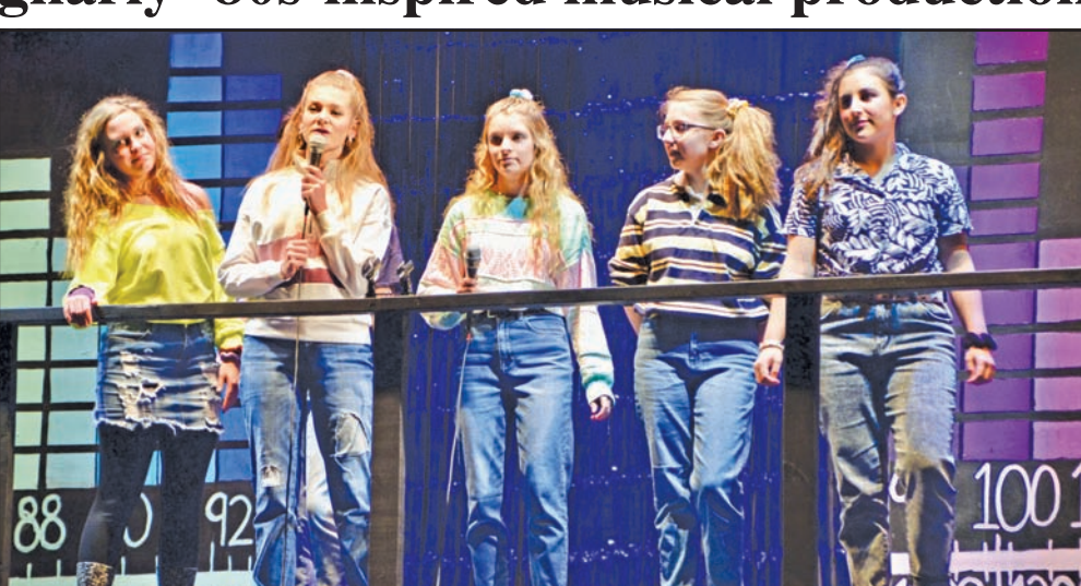
The UCHS Theatre Department put on three spectacular performances of "Back to the '80s" musical between Saturday, Nov. 16, and Monday, Nov. 18.