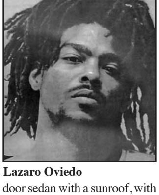
an as of yet unknown white

an address in Enota Village Apartments in Young Harris, is 5-foot-11, 158 pounds, with black hair and brown eyes. He was last seen in a white, four-Vol. 107 No. 1