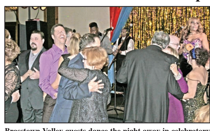
Brasstown Valley guests dance the night away in celebratory anticipation of 2016\

North Georgia News Staff Writer Young Harris - Area