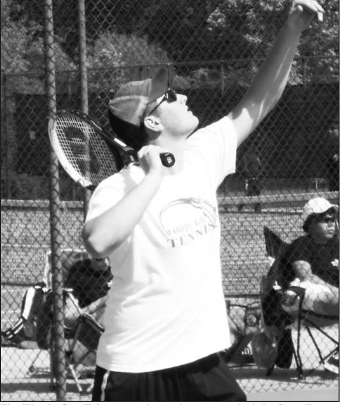
The Woody Gap Falcons men's tennis team reached the State Tournament in 2013.