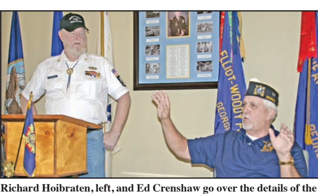
March 5 Seabee Ball

North Georgia News Staff Writer The Navy Seabee