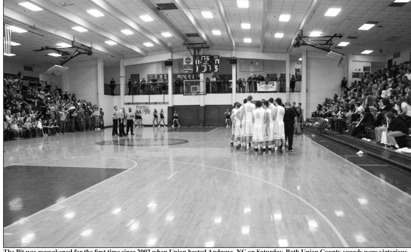
The Pit was reawakened for the first time since 2002 when Union hosted Andrews, NC on Saturday. Both Union County squads were victorious. And with a pep band and the Pit Crew out in full force, the visitors left with a loss, ringing in the ears, and some hurt feelings.