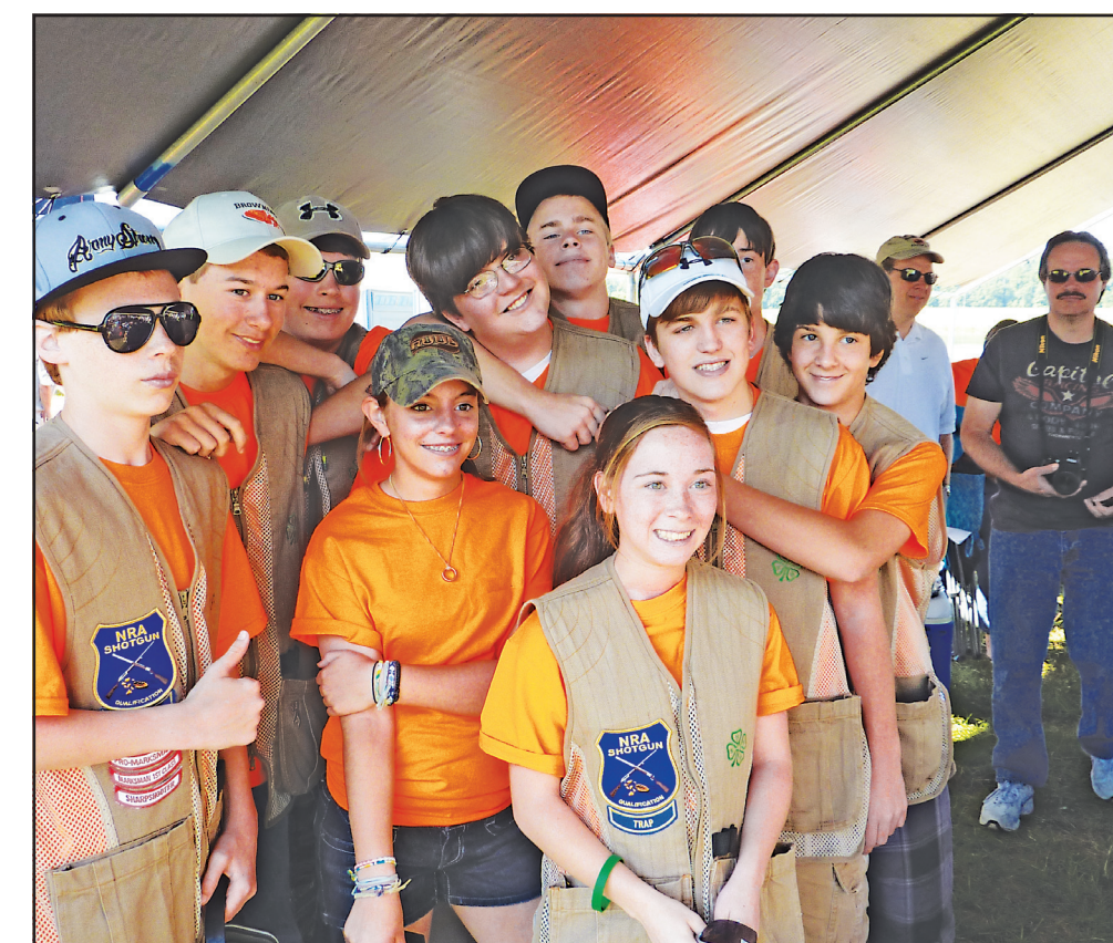
The Union County 4-H Shotgun Team at last year's District Shooting event here in Union County. The team is on the verge of realizing a "home, sweet home" on Georgia 515.