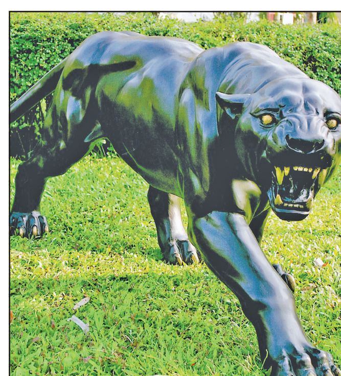
fixture outside the Union County Panthers' field house.

ber of the 1957 squad, who is mayor of Blairsville, said he felt local businesses and former Panthers would come to the rescue.