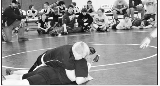
Panther wrestling traveled back to Hiawassee for a meet that involved vouth wrestlers. Union middle school would win, and high school lose

Youth wrestlers steal the show