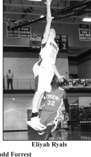
Union County Panthers basketball photos by Todd Forrest