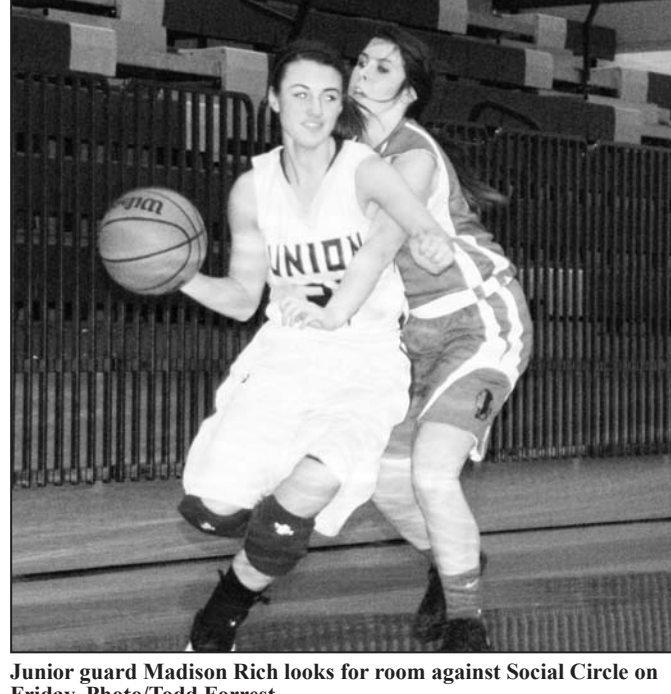
Friday.