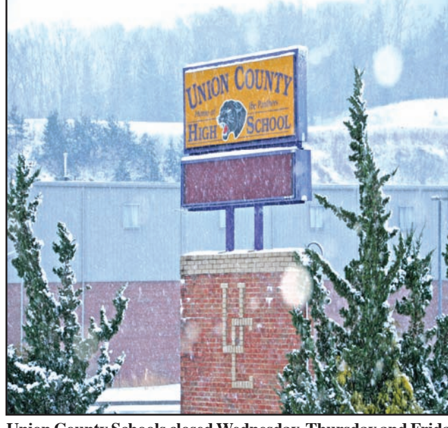
Union County Schools closed Wednesday, Thursday and Friday last week due to inclement weather

has been making school closing decisions for more than 30 years in his various administrative roles, closing schools Wednesday was all about the ground being cold and getting students to and from school safely.