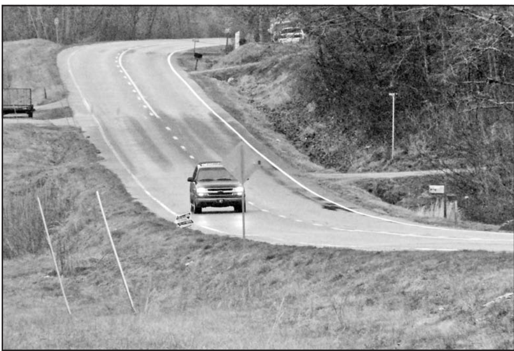
This stretch of U.S. 19/129 was not friendly to motorists on Friday as black ice conditions made driving treacherous and an incredible chore.