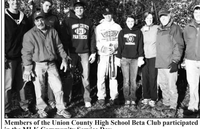
in the MLK Community Service Day.

Over 30 Union County nity volunteers were already High School Students, teachers, and administrators gathered with eight community leaders to turn a school holiday into a community service day. The Union County High