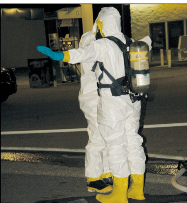
Appalachian Drug Task Force Hazmat officers prepare to disassemble a rolling methamphetamine laboratory in Blairsville.

By Charles Duncan North Georgia News editor@nganews.com