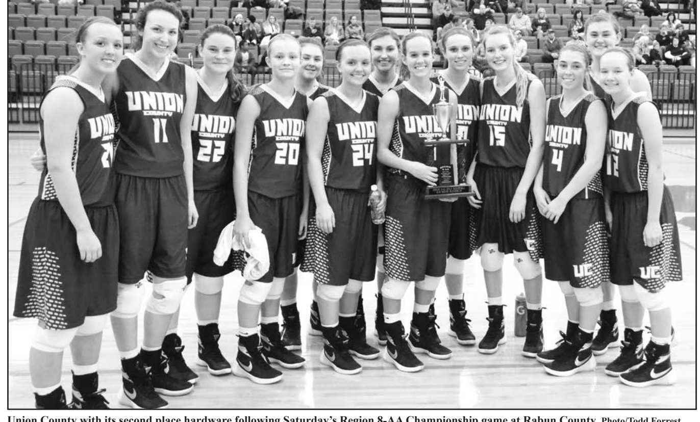
Union County with its second place hardware following Saturday's Region 8-AA Championship game at Rabun County

Layne Colwell finished with 5 points on 5-of-6 shooting from the line. Four boards, 3 steals, a 2 assists rounded out the stat line for the Lady Panthers