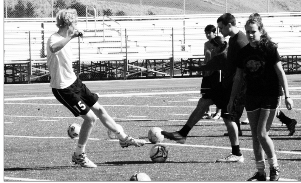
Union County soccer practice is underway. at 4:30 p.m. on Friday.

Union opened with Pickens County on Tuesday before playing host to Towns County