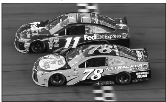
Hamlin then Truex cross finish line

Polesitter and Saturday's Xfinity Series winner Chase Elliott lost control of his No. 24 Hendrick Chevrolet during lap 20, and spun down on to the infield grass. By the time his team had made repairs to his car he