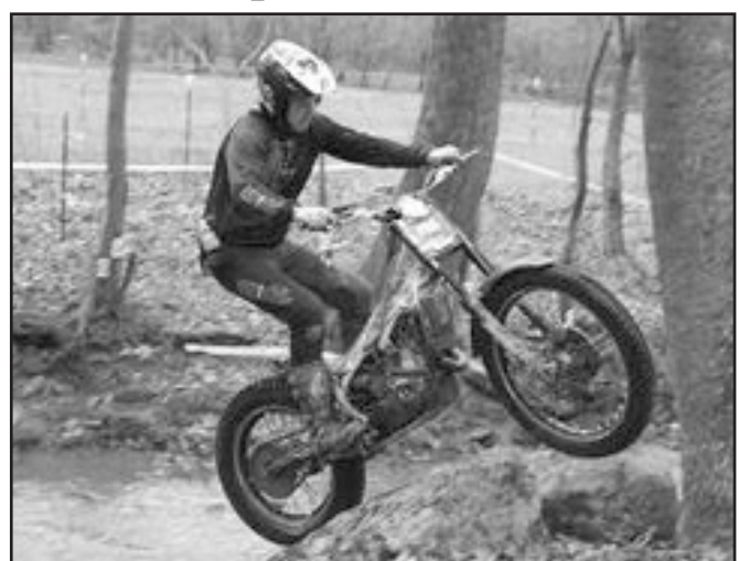
Bikes and bikers will be competing

The Southeastern Trials Riders Association (STRA) is a group of members located in 7 southeastern U.S. states. They are dedicated to the exciting and family friendly sport of Observed Motorcycle Trials. They cater to both the serious competitor and the casual or fun rider. The competition schedule consists of 12 or more STRA championship events with classes for modern and vintage bikes. NT(Feb24.Z18)gg