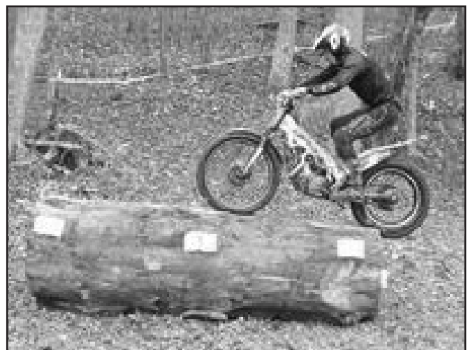
Participants must possess extraordinary balance and agility skills