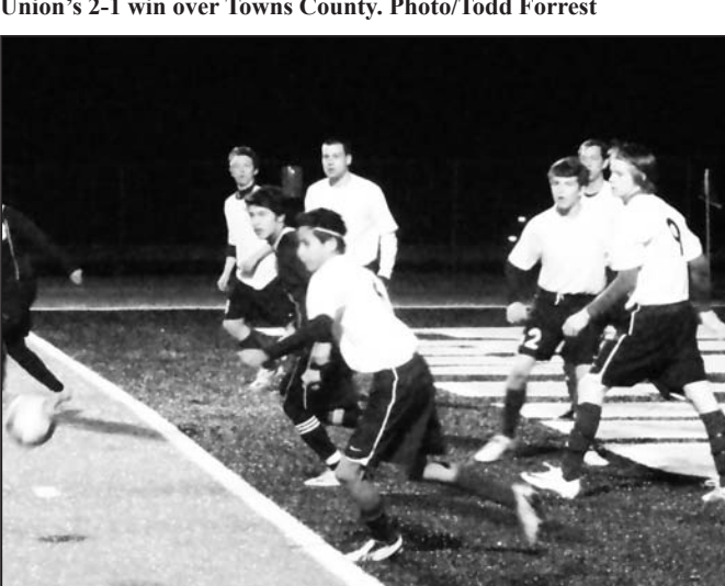
Union County capped off the evening with a sweep of Towns County after the Panthers prevailed 5-0 on Thursday.

The game was eventually called off by both coaches due to lightening.