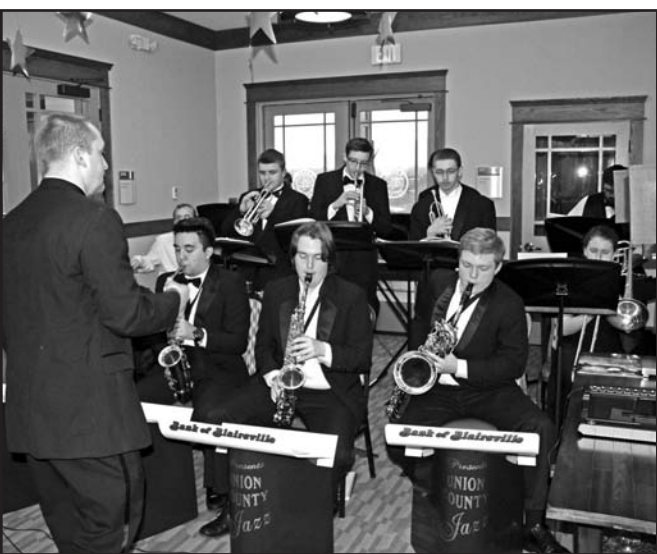
The Union County Jazz Band keeps the mood high at the Blairsville-Union County Chamber of Commerce's annual STAR Student event