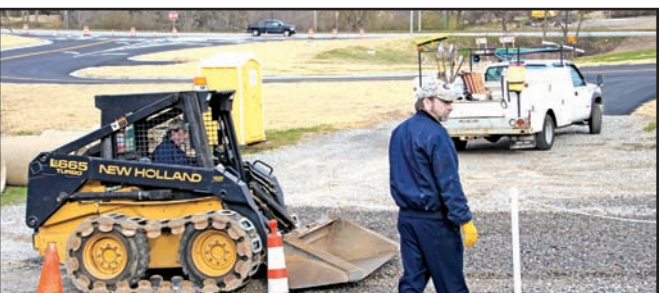
City of Blairsville workers spread gravel to shore up the parking lot adjacent to the new off ramp of the Haralson Development Project