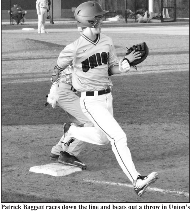
win over Riverside.