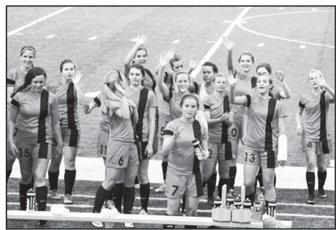
The Lady Panthers acknowledge their fans after the win at Social Circle. The victory was Union's sixth shutout of the season - matching the 2013 team's season total of six shutouts. The 2015 Lady Panthers are now one shutout shy of matching last year's total of 7 shutouts with six regular season games remaining.