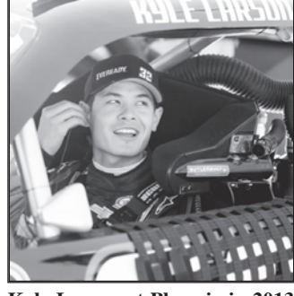
Kyle Larson at Phoenix in 2013