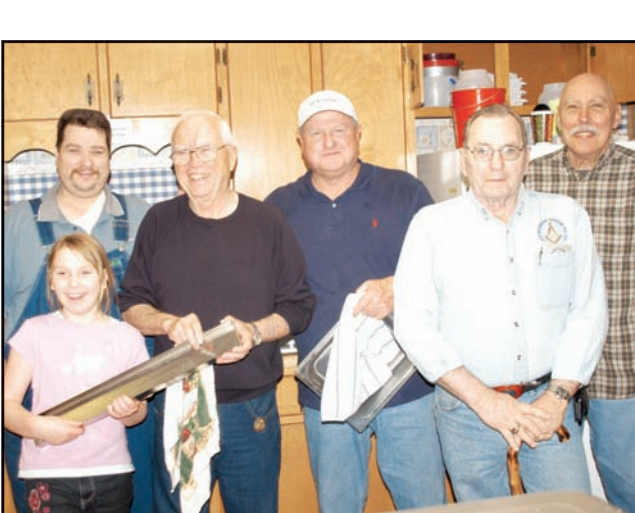
Servers at Allegheny Lodge No. 114's Big Country Breakfast were sad to see the day end Saturday. They like serving up hot meals and conversation.

'We break out the works. And that comes with coffee, juice and tea. What ever you