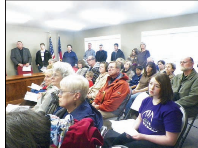
Blairsville City Hall was packed on Thursday.