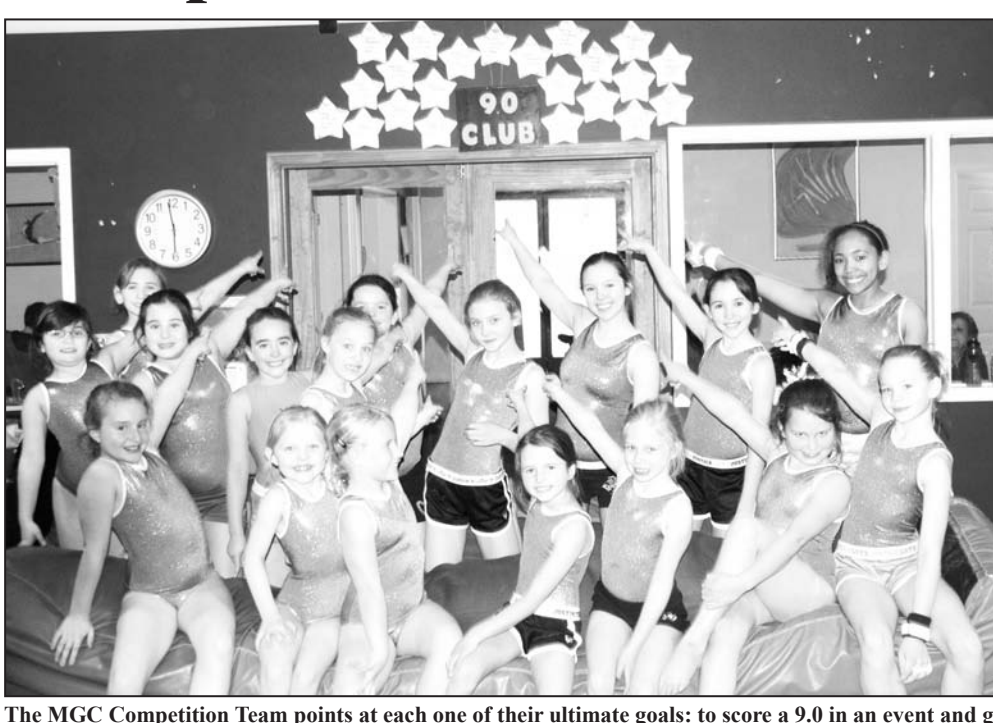
The MGC Competition Team points at each one of their ultimate goals: to score a 9.0 in an event and get