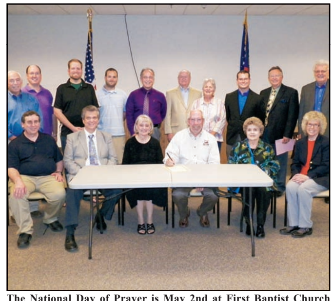
The National Day of Prayer is May 2nd at First Baptist Church Sanctuary at 7 p.m.

for worship. I always look forward to seeing the different pastors from the county's different churches."