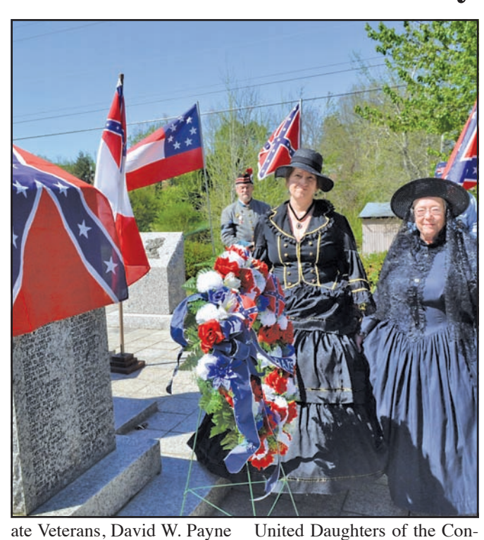
Camp No. 1633, and the

On Saturday morning, Union County's leaders, citizens, the Sons of Confeder-