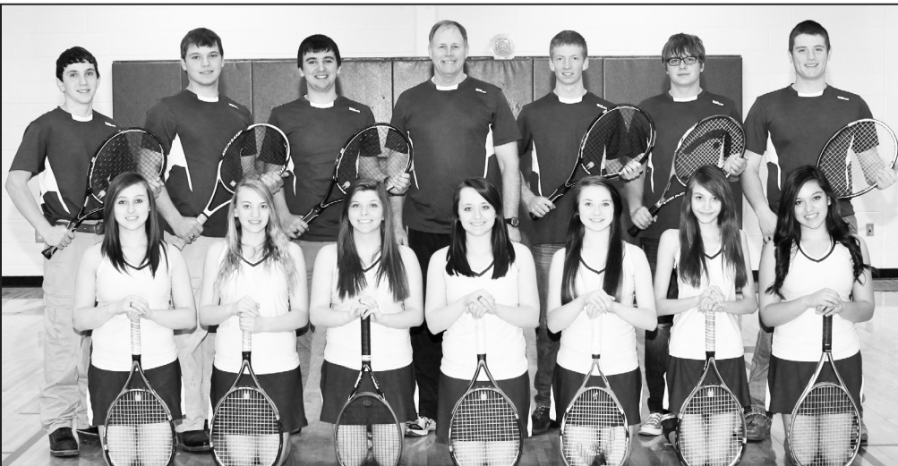
Woody Gap High School tennis was represented in the Class A State Tournament for the second consecutive year. They earned the right to compete at State after finishing in the top four in Area.