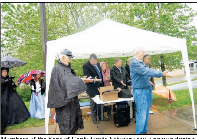
Members of the Sons of Confederate Veterans say a prayer during a rainy ceremony on Saturday remembering Confederate veterans of the War Between the States.

Union County Sole Commissioner Lamer Paris also proclaimed April as Confederate History and Heritage Month in Union