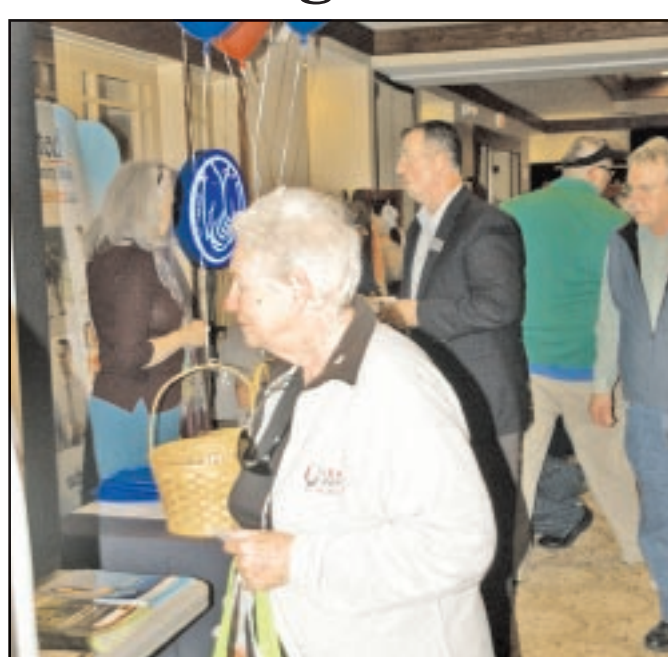
Local businesses got a little more familiar with their customer base during last week's Buy Local Extravaganza created by the Chamber of Commerce.