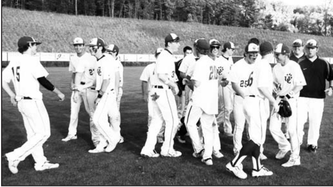
The Panthers celebrate after eliminating Bowdon in the first round of State.

In the sixth, Bowdon loaded the bases with no-outs, but Everett whiffed the next two batters. With two outs, Croskey came through again with a diving catch in right-center to end the inning and keep Union's lead at 5-0.