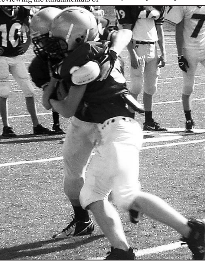
Union County football players practice tackling drills during spring practice.