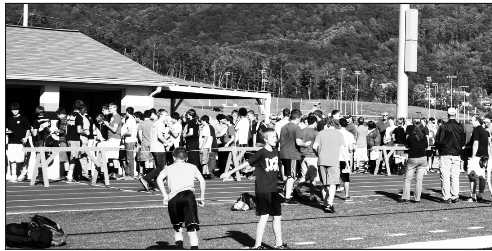
Last week, the Union County Quarterback Club hosted a cookout for players, coaches, and their families.