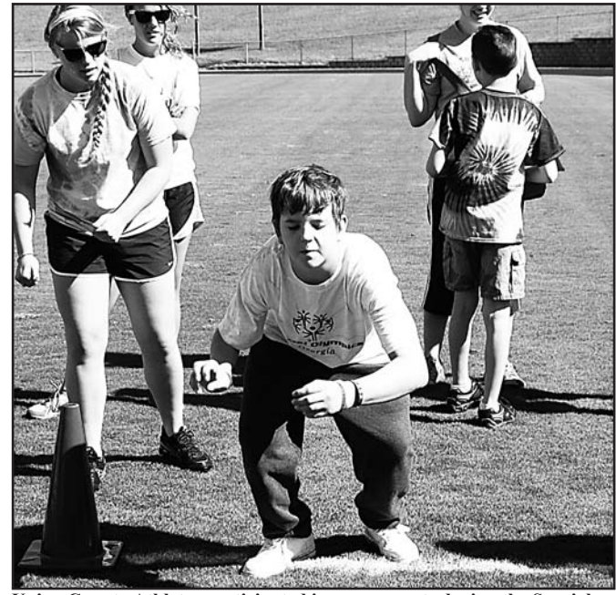
Union County Athletes participated in many events during the Special Olympics, including the standing long jump.

A special thank you was also extended to announcers,