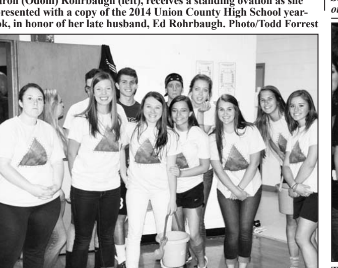
The Union County High School Annual Staff put in months of blood, sweat, and tears to publish the yearbooks that were handed out last Friday following the U-lympics.