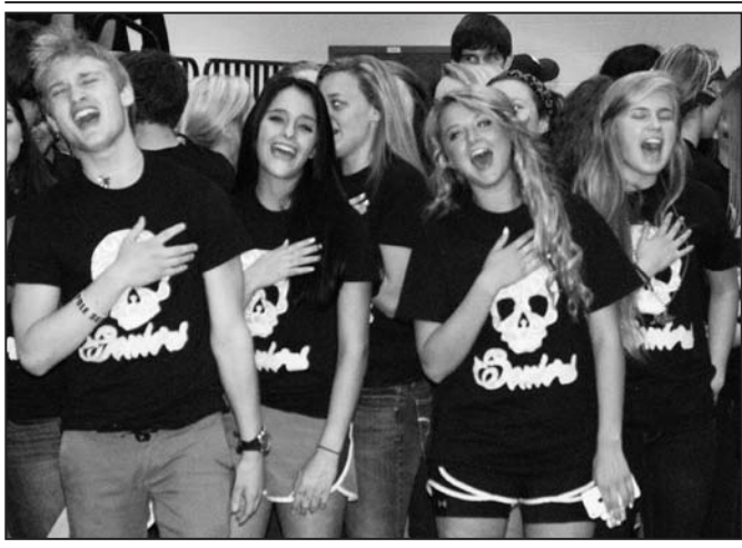
The senior class joins in on impromptu singing of the National An-them while the winners were being announced. Photo/Todd Forrest

The juniors celebrate after winning an event. Photo/Todd Forrest