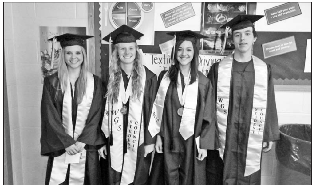
The Falcons' Class of 2013 in Suches.

She opened with some words of encouragement, that