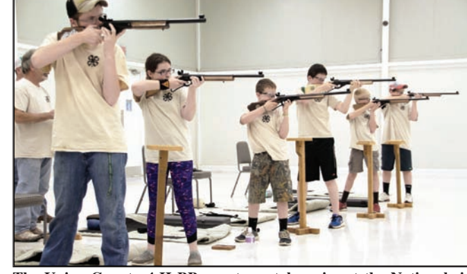
The Union County 4-H BB gun team takes aim at the Nationals in Arkansas in July. They'll be raising money this weekend with a Turkey Shoot at Stover Shooting Field.

The Union County 4-H BB Team will be hold-See BB, Page 2A