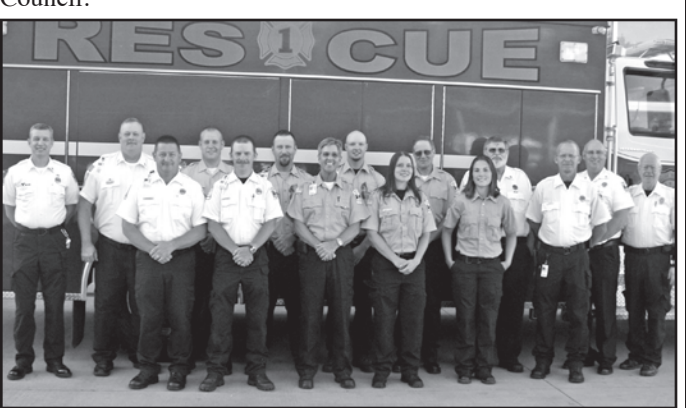
was at Station 4's Open House on Saturday.

At the end of the course, the recruits completed live fire training evolution, the NPQ ProBoard written and skills testing for NPQ Firefighter I and Hazardous Materials certifications administered by the Georgia Firefighters Standards and Training