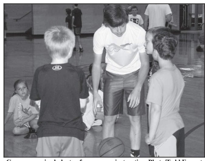
Campers received plenty of one-on-one instruction.

Following a one-win campaign in 1994-95, the program showed signs of life in 1995-96