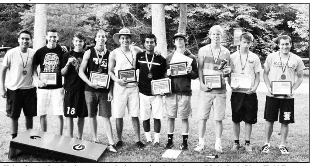
Union County Panthers' soccer award winners after the cookout at Meeks Park.