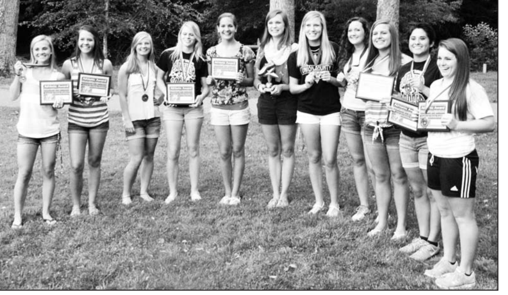
Lady Panthers' soccer award winners after the cookout at Meeks Park.