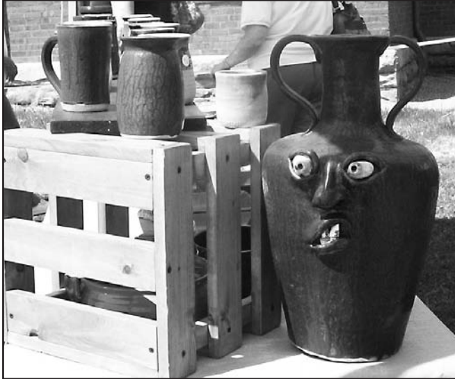
Face jugs and pottery