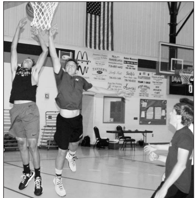
The Ross camp wasn't only for Panthers as it brought in players from Towns County and Hayesville, NC.