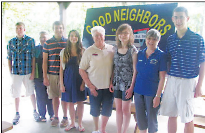
The Good Neighbors Auto Club proved that they really are good neighbors last Thursday at Meeks Park.

During their regular monthly meeting on Thursday night at Meeks Park, The Good Neighbors Auto Club showed that they really are good neighbors when its members awarded monetary scholarships to six rising college freshmen who recently graduated from high school in three surrounding counties - Union, Towns, and Cherokee.