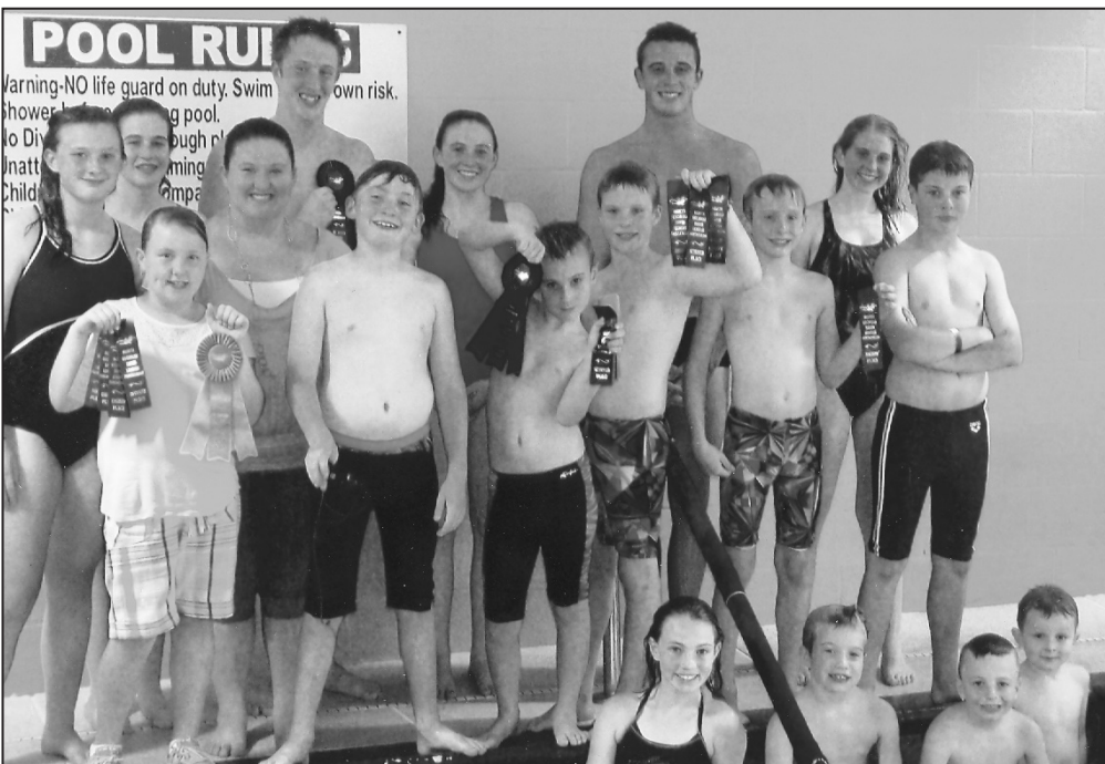
The North Georgia Rapids Swim Team sent seven swimmers to the Winder meet.

Water and Gatorade will be provided. Please bring Water bottle with name.