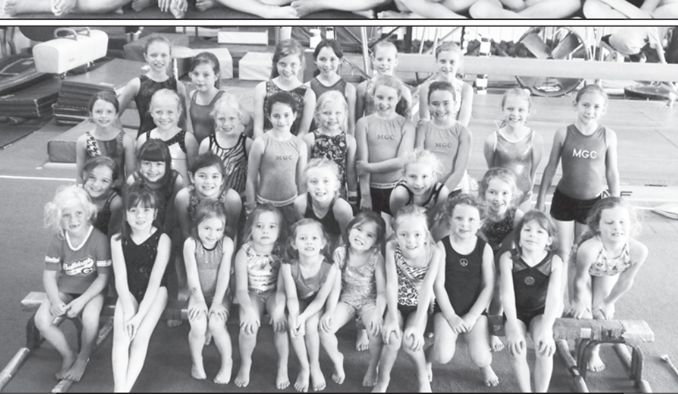
Last month, Mountain Gymnastics Center hosted a week-long Day Camp. There were more than 20 attendees to the camp, not including the 2013-14 Competition Squad that is gearing up for its season in the fall. The camp was for boys and girls ages 5 and over. It lasted three hours over five days. There will be another Day Camp this month.