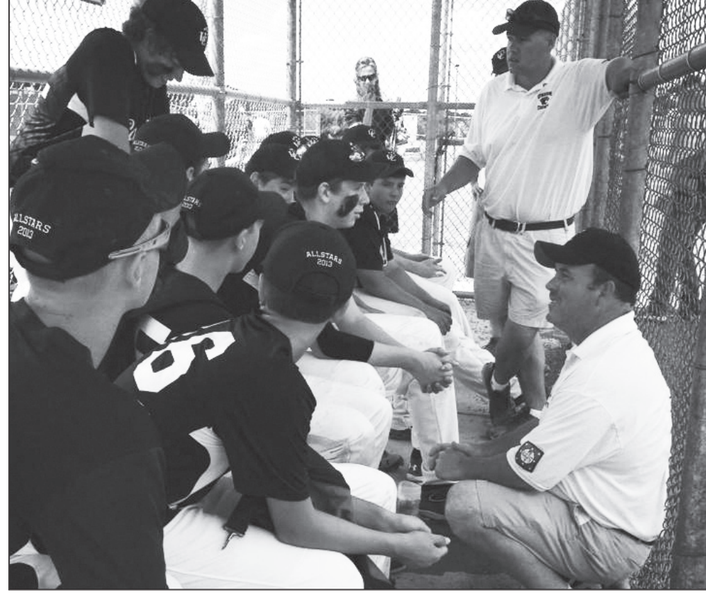
Coaches and team prepare for their State Tournament contest last week in Gordon County.