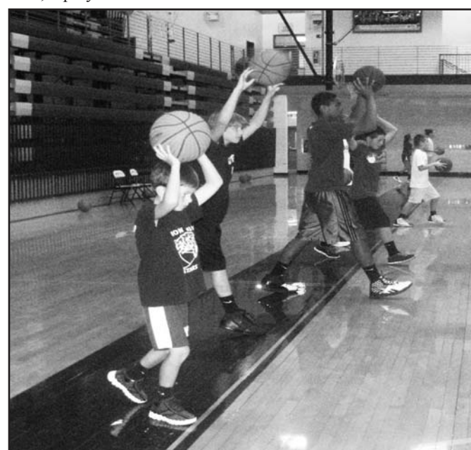
Players learn the fundamentals at Tucker's Shooting Camp last week at Union County High School.