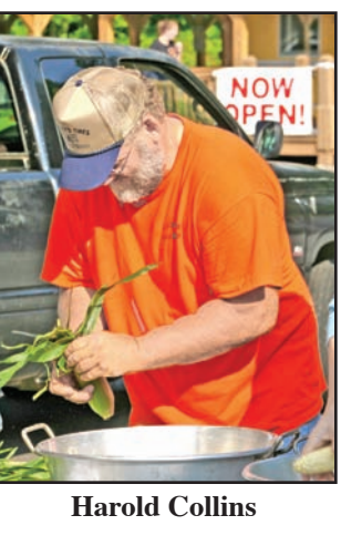
ily Farms with Silver Queen,

Participating vendors were SSM Farm with its Golden Queen corn, 7M Fam-