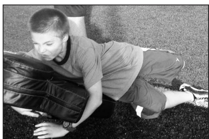
Camper were giving it all they had during the tackling drills.